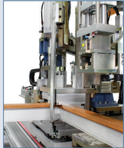
Motor moveable sealing forming units pushing and pulling