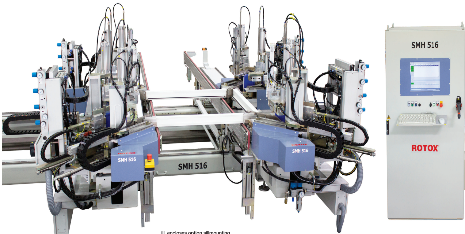
ill. encloses option sillmounting

High-performance welding machine for the simultaneous welding of four profile bars to a frame at an angle of 90° with diagonal push method with servo-drives